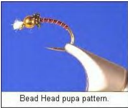
Bead Head pupa pattern.