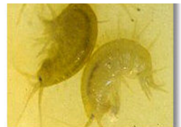
A group of scuds feeding. The top scud with the orange spot is the pregnant female.

Body: usually dubbing of your color choice Shellback: strip of plastic bag, Scud-Back, etc.