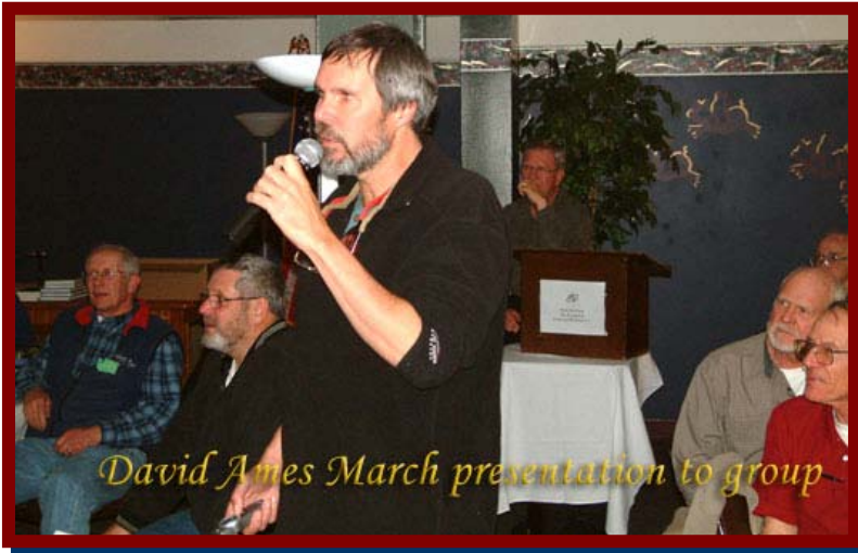
EFFC March Meeting Program Photo